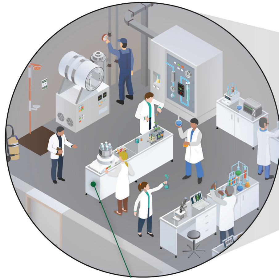
Direct costs - These expenses solely cover research and include lab supplies and equipment; salaries and stipends for researchers and graduate students; and travel costs for conducting and sharing research

The total cost of federally sponsored research includes a combination of both direct and facilities and administrative (F&A) costs. Both types of expenditures are key to an institution's ability to conduct cutting-edge research. F&A consists of the construction and maintenance costs of laboratories and high-tech facilities; energy and utility expenses; and safety, security, and other government-mandated expenses. These costs are real and research cannot be conducted without them.